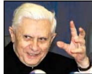
Pope "bring on the Inquisition" Ratzinger*