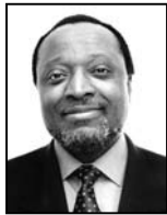
Alan "my family values include disowning my Lesbian daughter" Keyes*