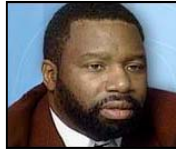
Reverend Senator James "Two Titles" Meeks*