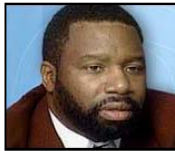
Reverend Senator James "Two Titles" Meeks*