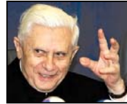
Pope "bring on the Inquisition" Ratzinger*